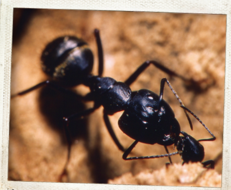
Two black carpenter ants (Camponotus pennsylvanicus) engage in trophallaxis.

• They will feed on nearly anything people eat, including sweets. Aphid honeydew is especially appealing.