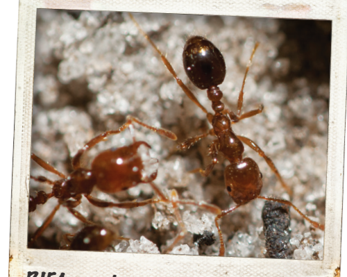
RIFA workers scavenge for food.

• Occasionally, the ants will nest under bathtubs (the slab under the